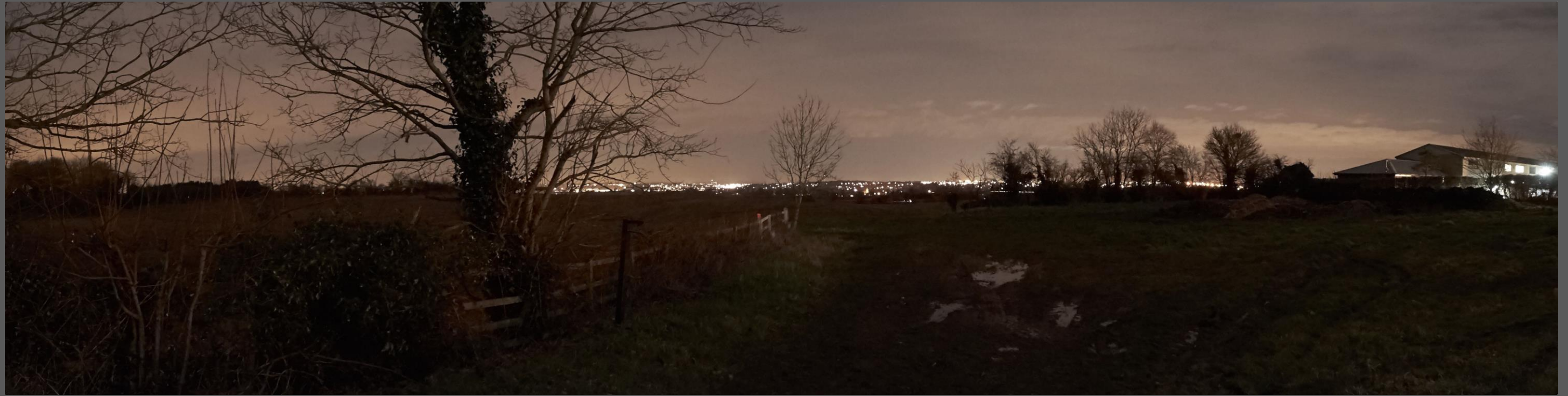
Figure A11.2.5 – Location D. View from Courteenhall Road close to the junction with Connegar Leys, Blisworth, looking towards Northampton.