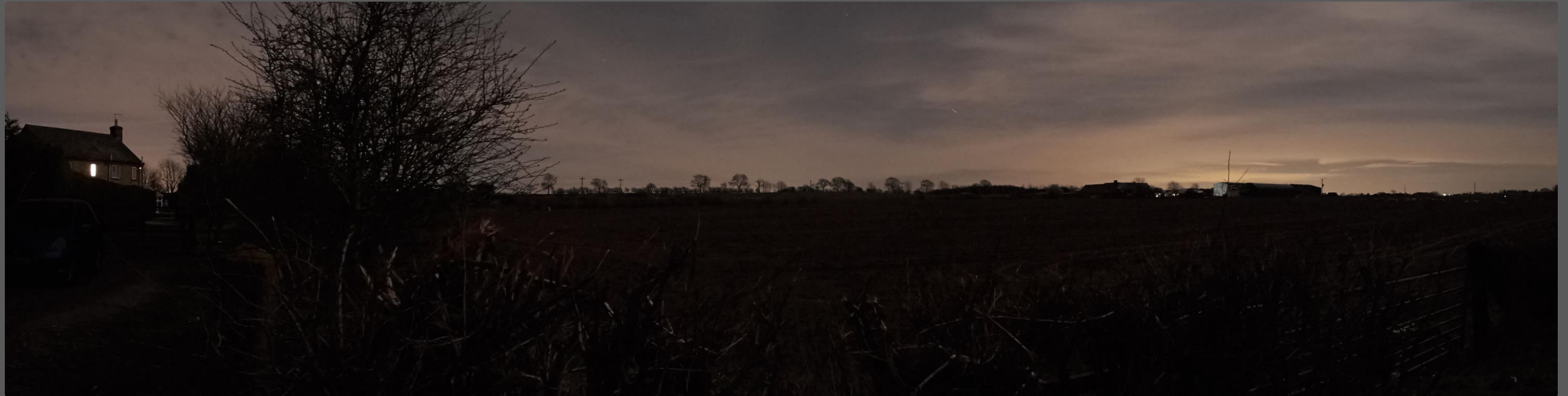
Figure A11.2.7 – Location F. View from Barn Lane near Rathvilly Farm, looking Northeast – East – Southeast.