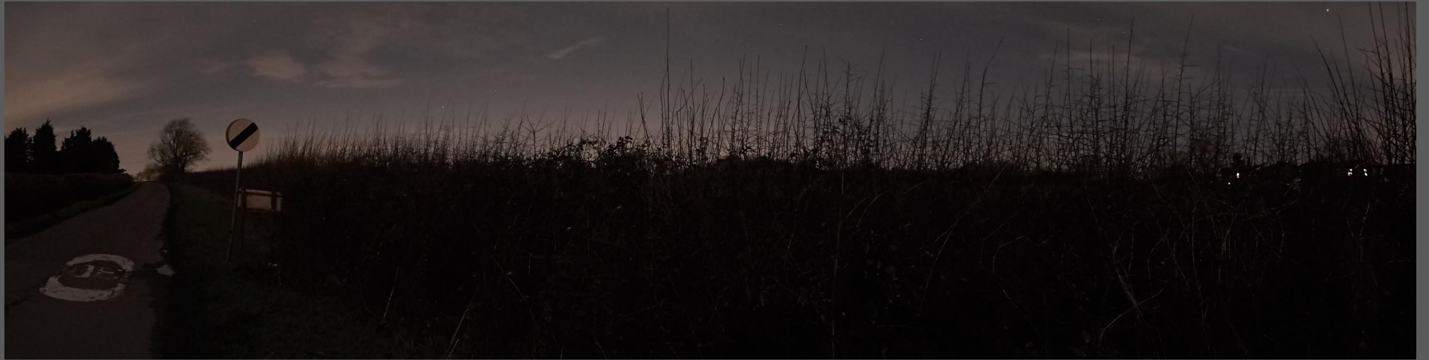
Figure A11.2.9 – Location H. View from Blisworth Road near the junction with Dovecote Road, looking Northwest – North – Northeast.