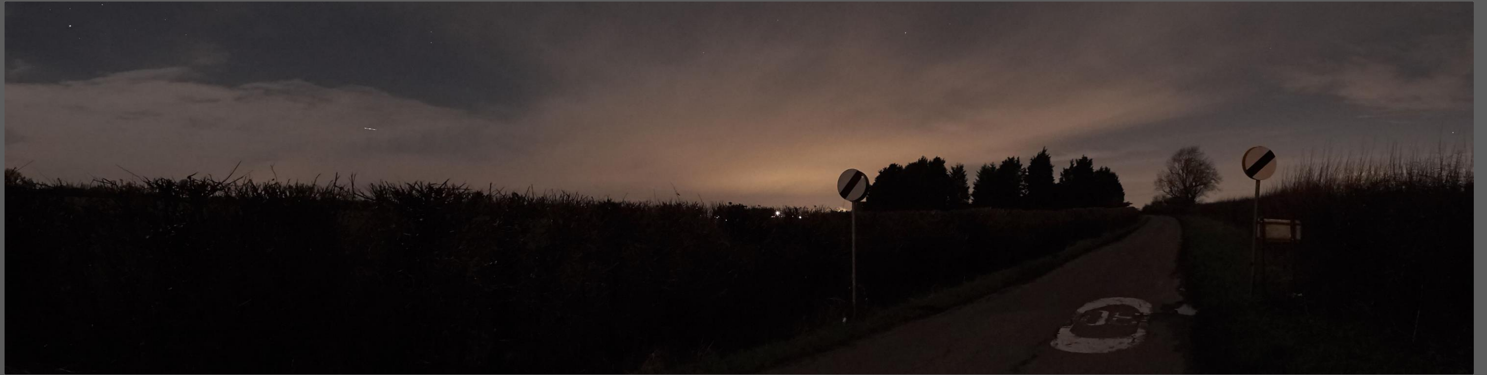
Figure A11.2.12 – Location H. View from Blisworth Road near the junction with Dovecote Road, looking Southwest – West – Northwest.