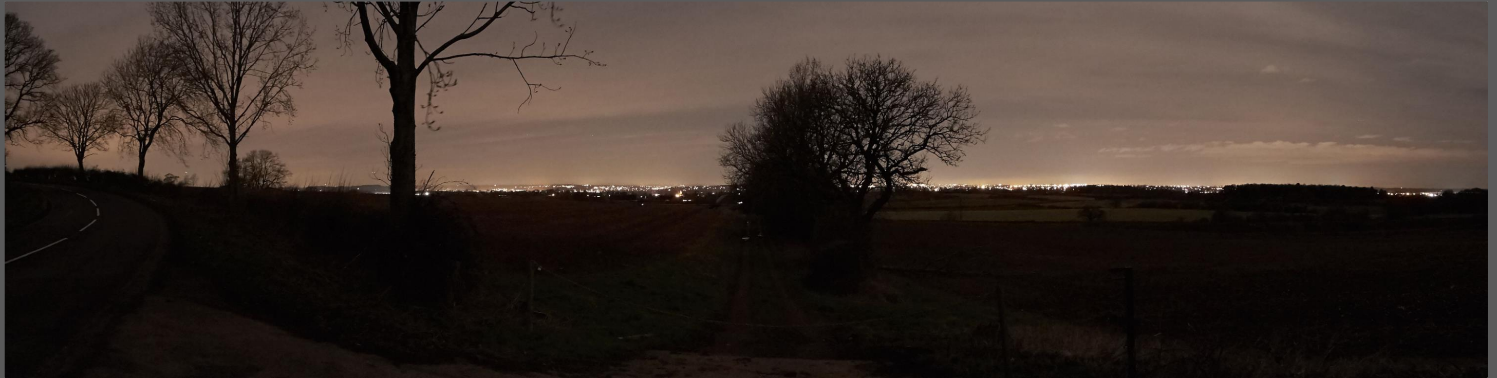
Figure A11.2.4 – Location C. View from Courteenhall Road by Footpath RD22, looking towards Northampton.