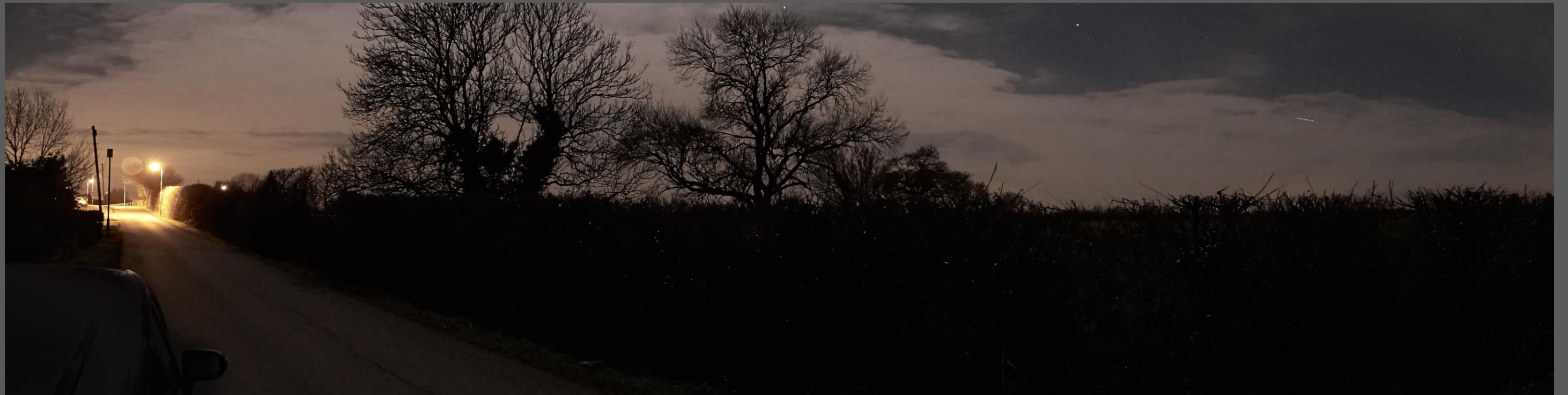
Figure A11.2.11 – Location H. View from Blisworth Road near the junction with Dovecote Road, looking Southeast – South – Southwest.