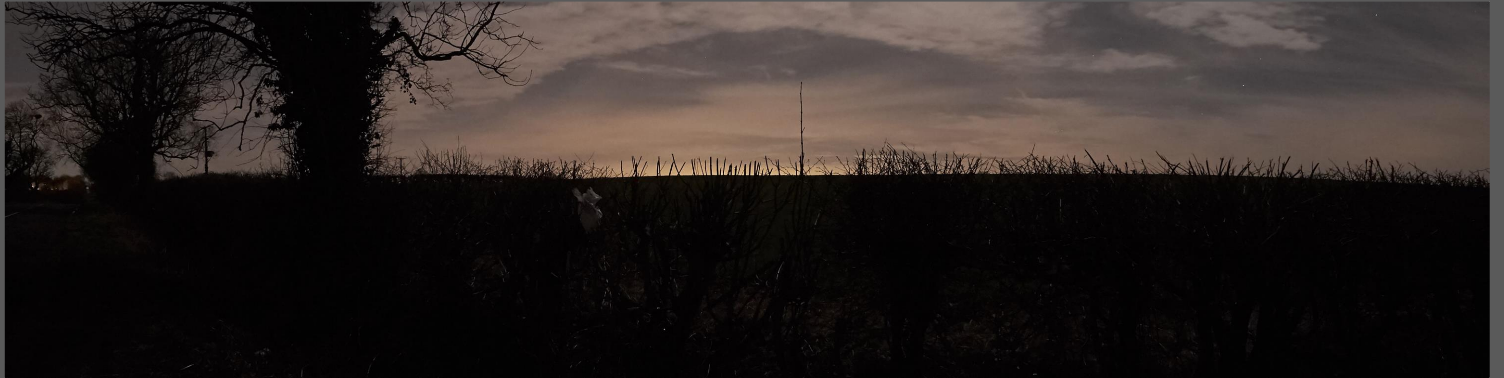
Figure A11.2.8 – Location G. View from Collingtree Road near Maple House, looking East – Southeast – South.