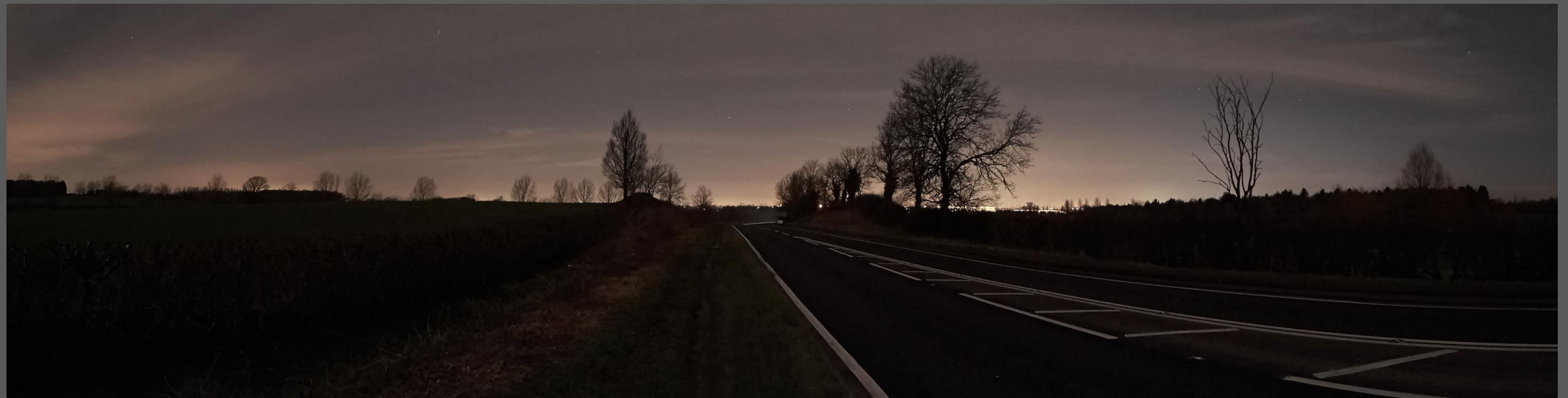
Figure A11.2.2 – Location A. View from A508 Northampton Road close to the Courteenhall/Quinton turning, looking towards Northampton.