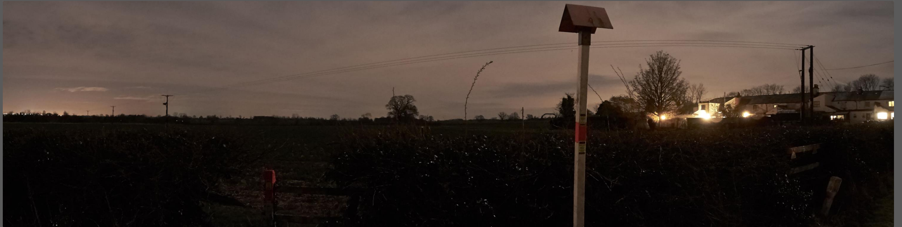
Figure A11.2.6 – Location E. View from Northampton Road Blisworth immediately north of the rail bridge, looking Northeast – East – Southeast.