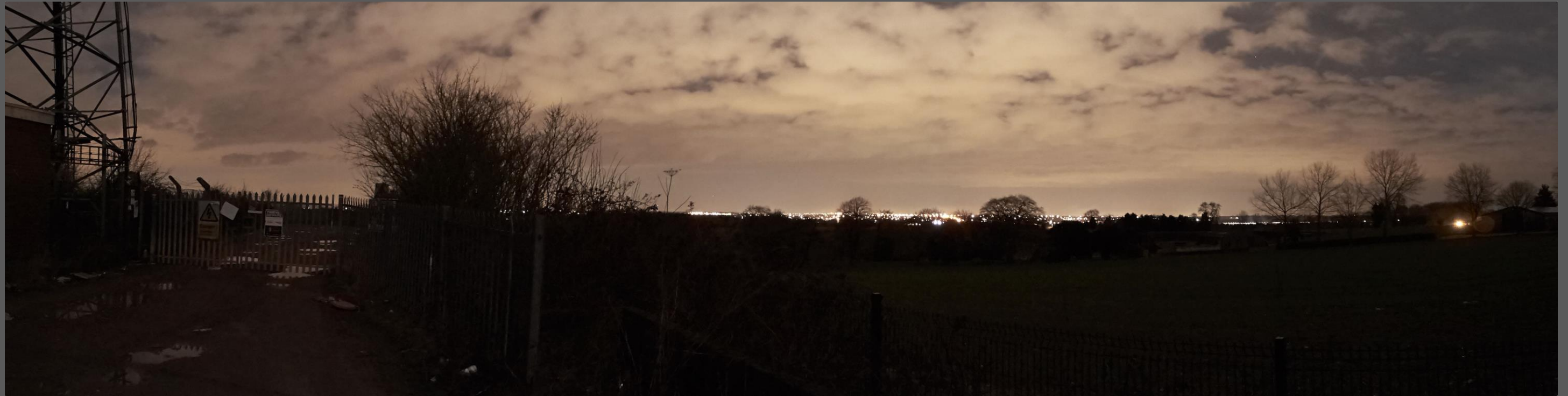
Figure A11.2.3 – Location B. View from Courteenhall Road close to rail bridge and communications tower, looking towards Northampton.