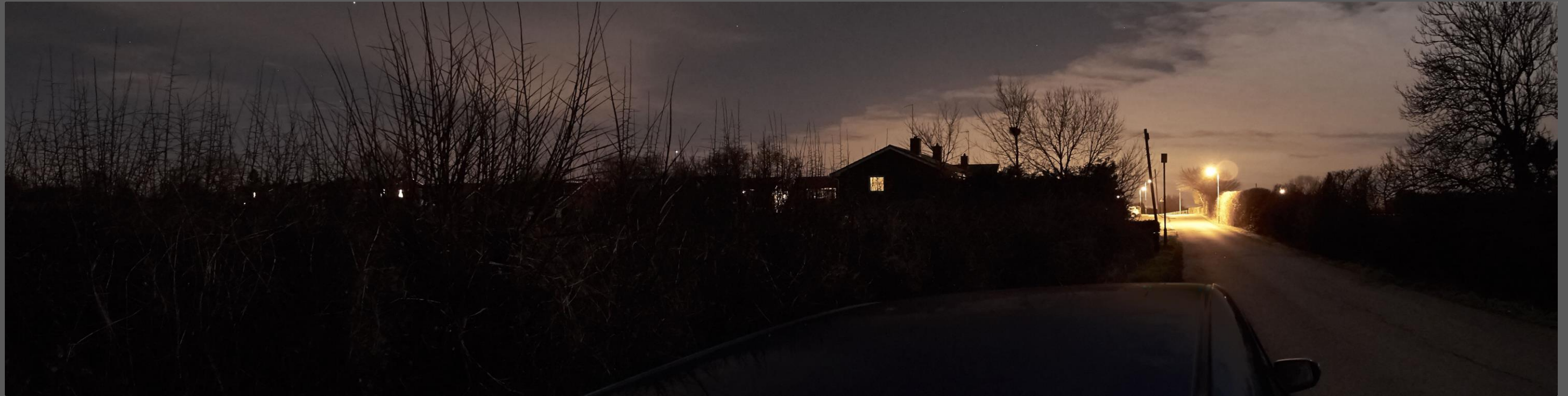
Figure A11.2.10 – Location H. View from Blisworth Road near the junction with Dovecote Road, looking Northeast – East – Southeast.